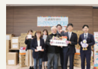
Food drive initiative

The Bank organizes a Food Drive Movement in which unused food is collected and donated to volunteer-run children's cafeterias in Saitama Prefecture, in order to support the healthy development of local children. Furthermore, young carers who act as caregivers to family members have become a social concern. Working closely with Saitama Prefecture, support organizations, and other partners, the Bank actively provides support by holding networking meetings for young carers, and seminars for supporters.