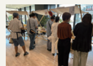
Market for products made with wheat grown in Saitama

At the regional revitalization space, M's SQUARE, located on the second floor of the Head Office building, we disseminate information about the attractions of the region and challenges to be addressed, as well as host events that serve as networking forums for community members, in coordination with local governments, companies, organizations and other partners.