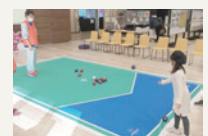
Parasports Experience Event